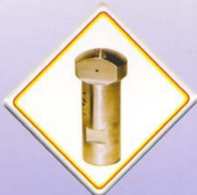
Low NOx Gas Tips