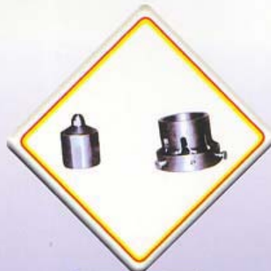
Oil Burner Assembly